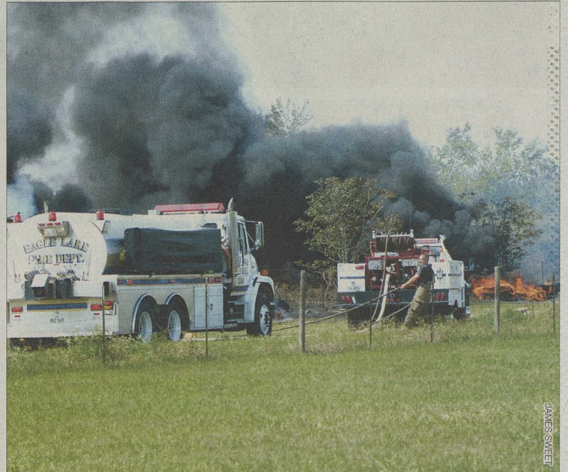
The Eagle Lake Volunteer Fire Department was called to a controlled burn off Old Altair Road last Thursday. The fire had gotten out of control.