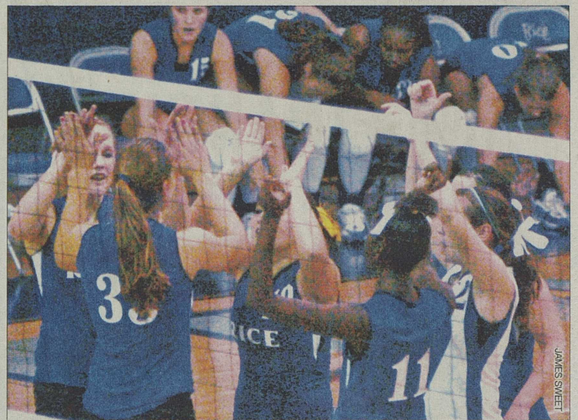
The Lady Raider Volleyball team celebrates after a point during a match against Round Top last Tuesday.